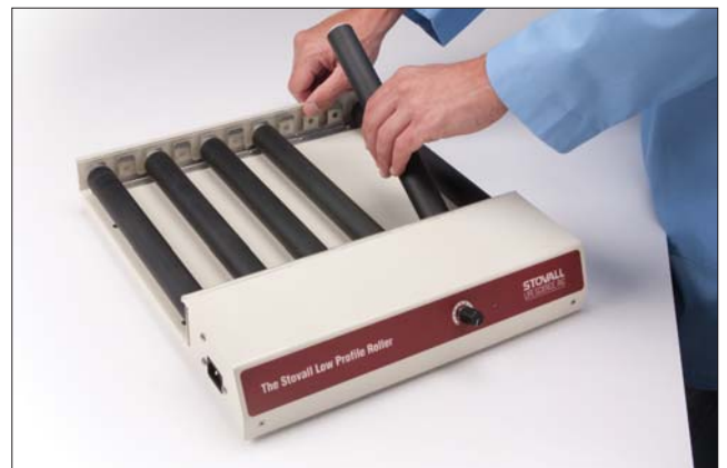
Rollers can be removed for cleaning or adjusted to accommodate variously sized bottles and tubes.