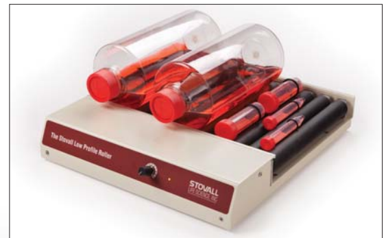
By adjusting the roller positions or adding additional rollers, one can accommodate different size containers. Pictured are two cell culture bottles along with two 50ml and 15ml tubes.