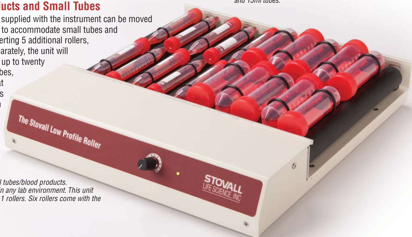
Agitation of small tubes/blood products. Portable for use in any lab environment. This unit is pictured with 11 rollers. Six rollers come with the basic unit.