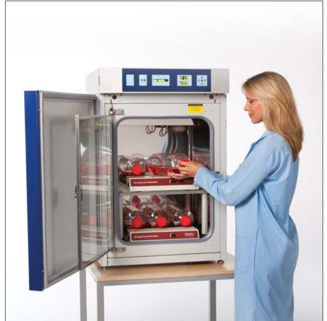
The Low Profile Roller fits easily into incubators, ovens or refrigerators without disturbing other materials.