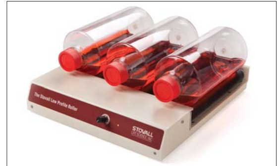
For cell culture in dry or humid incubator environments.

The six rollers supplied with the instrument can be moved close together to accommodate small tubes and bottles. By inserting 5 additional rollers, purchased separately, the unit will accommodate up to twenty 10 to 50 ml tubes, turning them at variable speeds between 1 rpm and 67 rpm.